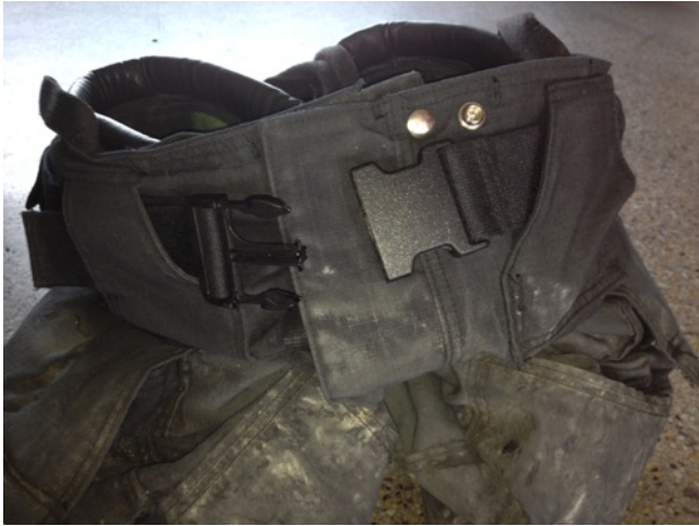
Original nylon belt provided with turnout gear.

Many turnout manufacturers are now offering turnouts with nylon belts and plastic quick connect buckles instead of suspenders. These pants already have loops, Velcro tabs, or both to keep the belt attached to the pants. If you are currently wearing this style pant, remove that belt. All it is good for is holding your pants up. Replace it with whatever truck style belt you already have or can afford.