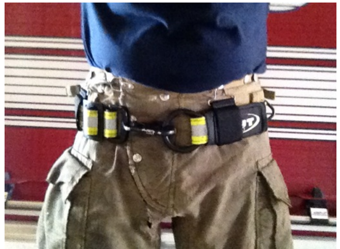
Nylon belt replaced with a Gut Belt.